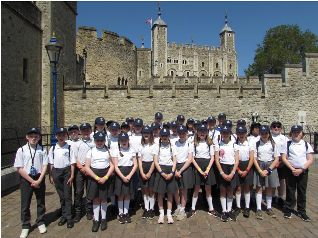
Year 6 children enjoying their residential visit