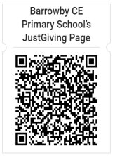
Barrowby CE Primary School's Just Giving Page

This fund raising event is run by Grantham Rotary Swimarathon to raise funds for good causes in the local area. If you are not able to join us to take part in the Swimarathon this year but would like to donate to this worthwhile cause please use the QR code provided to take you to the Just Giving website to make your donation.