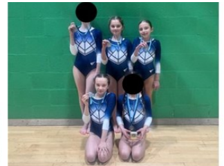
U7's Mixed Team - 1st & 2nd Place U7's Boy's Individual - 1st & 2nd Place