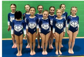
U9's Girl's Team - 1st Place