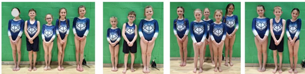
U9's Mixed C Team