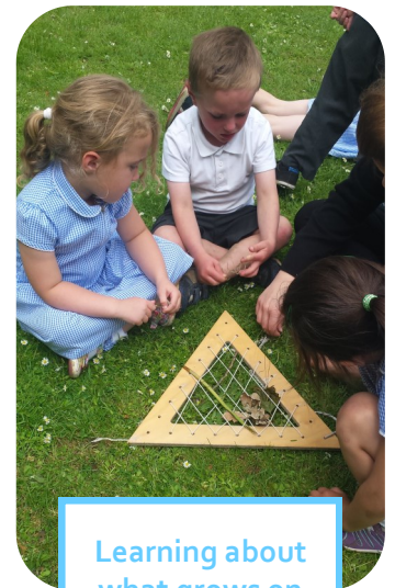
Learning about what grows on our field