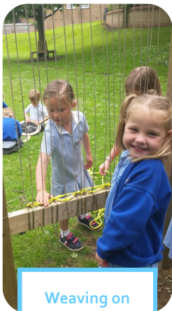
Weaving on our outdoor Earth Loom

Our Key Stage 1 children have been enjoying the summer weather in our school grounds—our Year 1/Year 2 classes have been using our grounds as part of their 'Open Your Eyes' topic, and our Reception children have enjoyed weaving on our outdoor loom. Let's hope the fine weather continues for all of our summer term activities!