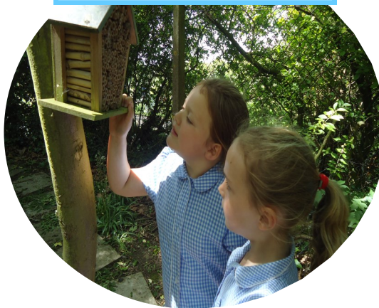
Mini Beast Hunting in our Wildlife Area