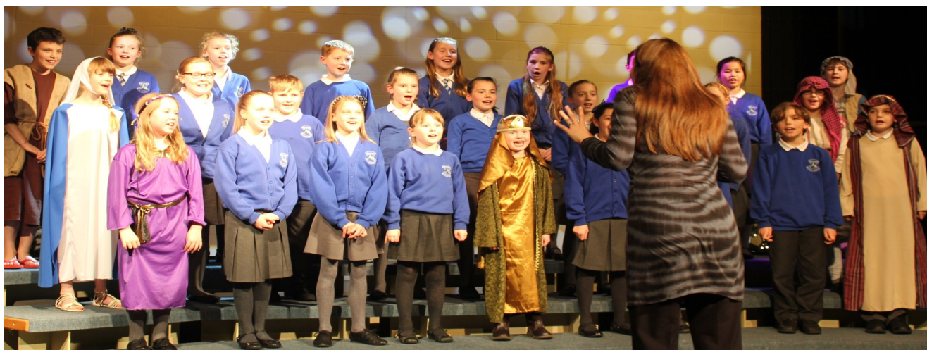
Our Year 5 & 6 Choir at Walton Girls High School Choir Festival