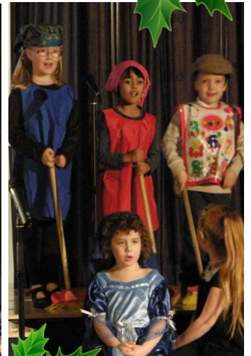
Key Stage 2: 'Do the Christmas Rock'