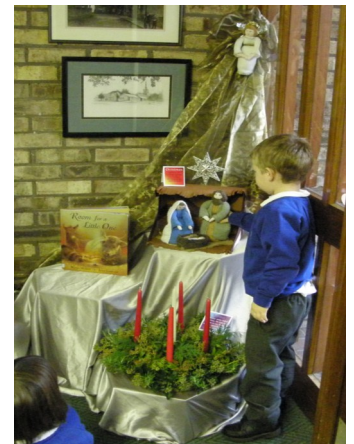
Reception children thought about the Christmas Story as they arranged our Nativity Scene, at the beginning of Advent.