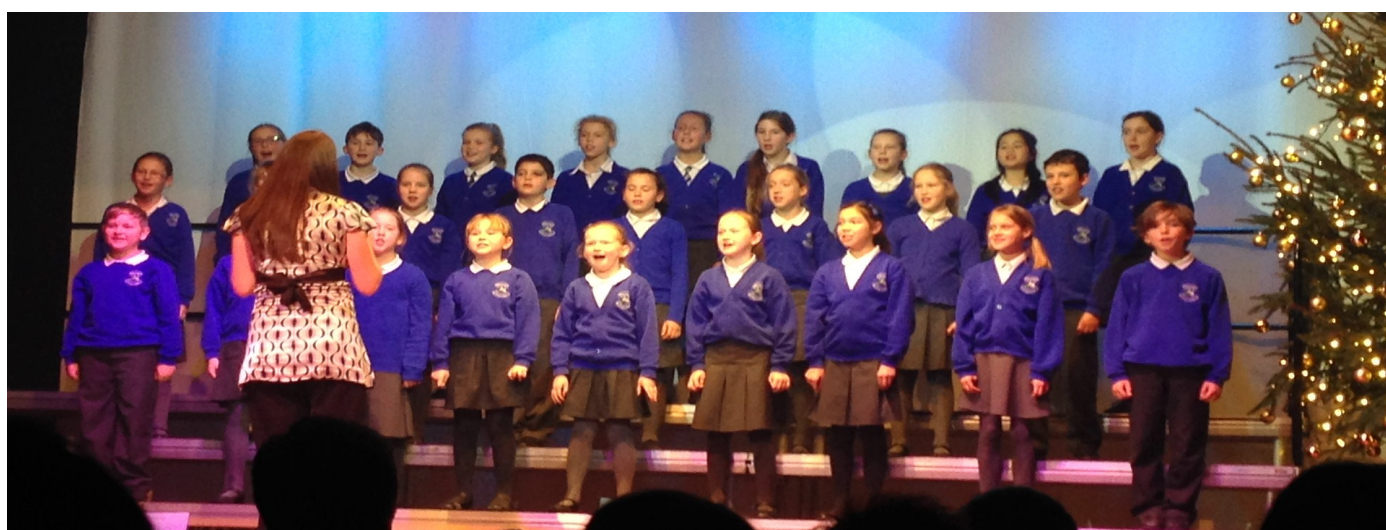
Our Year 5 & 6 Choir sing at Priory Ruskin Academy.