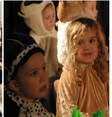
Reception: 'Simply Nativity' pictured above.