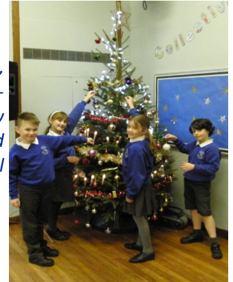
Year 4 children Decorating our Christmas Tree