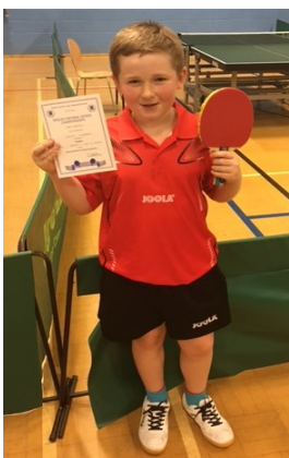
Table Tennis Success

We will soon be advertising posts for a Teacher, Teaching Assistant, and Cleaner. These will be posted on our website next week.