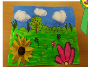
Key Stage 2- Design an Easter Garden