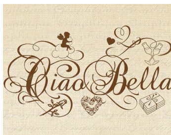
Ciao Bella Nails & Beauty

This event is kindly being sponsored by three local business: