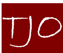
THE JOB OFFICE LTD