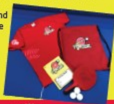
Table tennis is great for fitness, and provides valuable time away from video games and social media in a safe environment.

Starting from October 2019 / 8 weeks Grantham Meres Leisure Centre, Trent Road Grantham, Lincolnshire NG31 7XQ